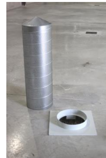
FloorVent components ready to be used