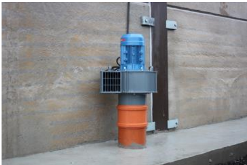
Pile-Dry Fans in position